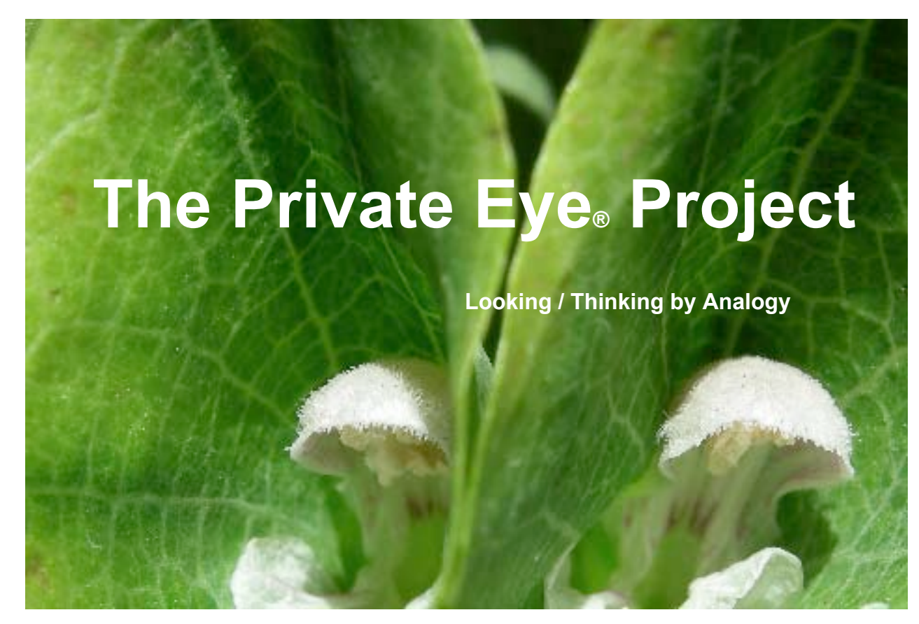
Grade 2 The Private Eye® aligned with Common Core State Standards for English Language Arts

& Literacy in History/Social Studies, Science, and Technical Subjects